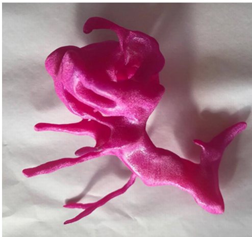
Figure 3 Anterior view of the full-size 3D printed tumour model demonstrating the arterial phase enhancement characteristics of the tumour and associated hepatic arterial branches. 3D, three-dimensional.

observers were entered into SPSS (SPSS 24.0, IBM Corporation, Armonk, NY, USA) for statistical analysis. A paired sample t-test was applied to statistically evaluate the magnitude and direction of difference in the mean measurements of specified anatomical landmarks acquired at each stage of data processing (5). Accuracy of the 3D liver model was achieved if the difference between in the mean of measurements obtained from the CT data and the 3D liver model was \leq 1 mm (24). Paired samples statistics are presented as mean \pm standard deviation, and paired differences are presented as the mean with the associated 95% confidence interval (CI) and t-statistic. T-statistics are presented as t(df)=t, p where t is the t-value, df is the degrees of freedom ( N-1 ), and P is the P value. Statistical significance was defined where P < 0.05 , being used to accept or reject the null ( H_0 ) or alternative hypotheses ( H_A ), where H_0 = \mu_{\text{difference}} = 0 and H_A = \mu_{\text{difference}} \neq 0 .